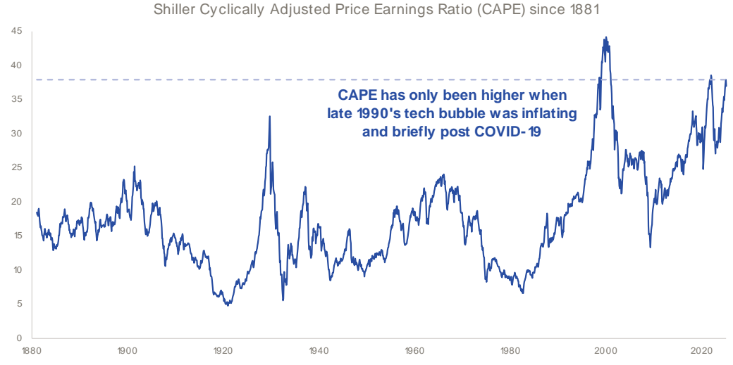
Source: AlphaQuest LLC and Bloomberg; January 1881 through January 2025 DISCLOSURES: Past results are not necessarily indicative of future results. Derivatives trading involves substantial risk of loss and may not be suitable for everyone. This is not a solicitation

After equity prices rise significantly, previous experience has taught option traders that the probability of a large decline is greater than the probability of large jumps upward. This is because after such strong returns, positive news typically has less of an impact as valuations are so elevated, while any negative news is likely to result in a swift downward movement in equity prices. This imbalance can be measured by skew and can be seen by looking at the CBOE Skew Index in the chart above. The CBOE Skew Index is calculated from options on the S&P 500 index and measures the relative probability of a large future downward correction in equities versus an upward jump. On January 22<sup>nd</sup>, the CBOE Skew Index reached 179.98, just below the 180.09 all-time high reached on Christmas Eve in 2024.