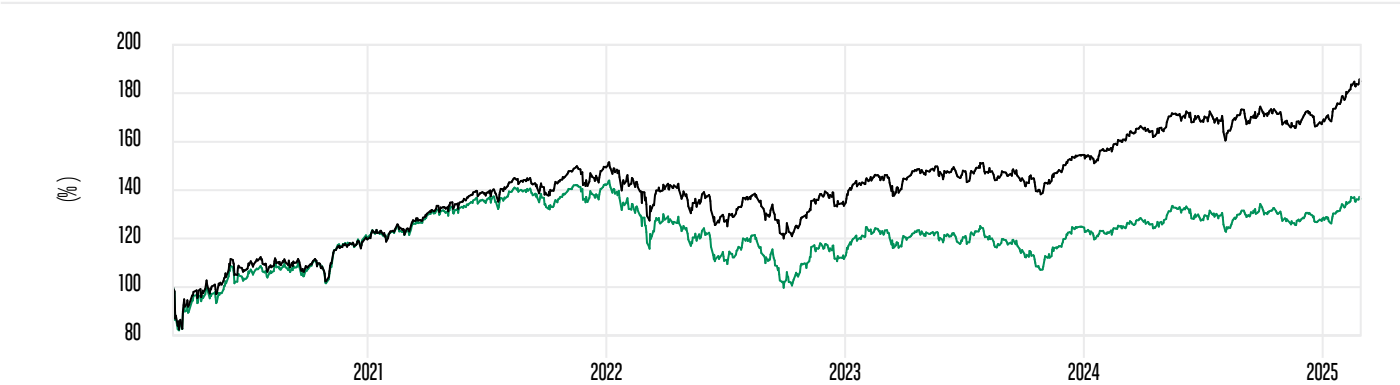
Cumulated Performance at 28.02.2025 (%)