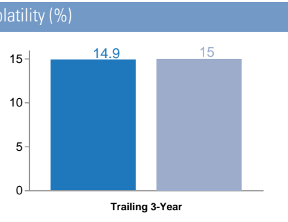
Goldman Sachs Global Real FTSE EPRA Nareit Developed Estate Equity Portfolio Index - USD Net Class P Shares (Acc.)

Goldman Sachs Global Real FTSE EPRA Nareit Developed Estate Equity Portfolio Index - USD Net Source: GSAM, Dividend vield figures shown are gross of taxes