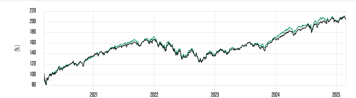
Cumulated Performance at 28.02.2025 (%)

(1) All figures net of fees (in USD). (2) Based on 360 days