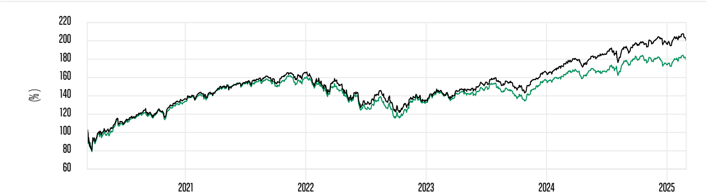
Cumulated Performance at 28.02.2025 (%)

(1) All figures net of fees (in USD). (2) Based on 360 days